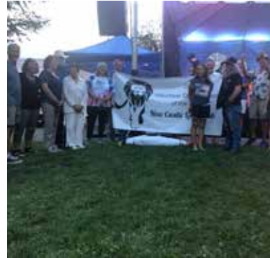
Organization of the Year New Castle Lions Club