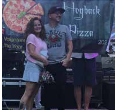
Business of the Year Hogback Pizza