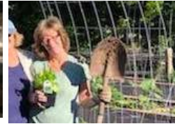
May Rochon Community Garden