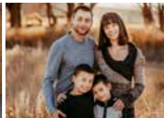
The Welk Family September - Meal Monkey