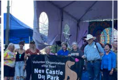
Organization of the Year New Castle Dog park