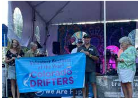
Business of the Year Colorado Drifters